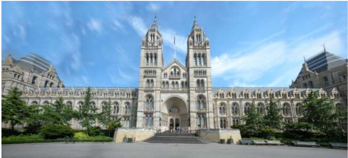
The entrance to the museum

http://en.wikipedia.org/wiki/File:London_Natural_History_Museum_Panorama.jpg (by Stephantom, 2008, CC BY-SA 3.0, 02.03.2022)