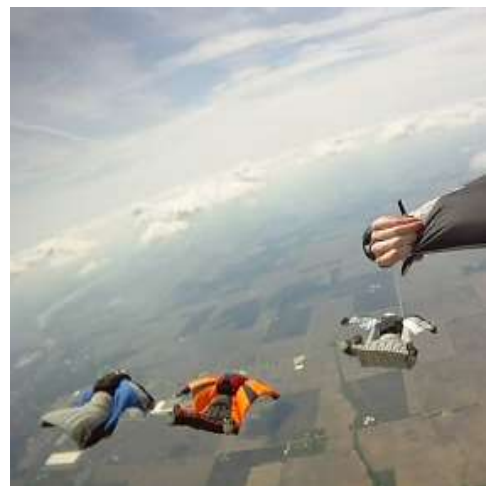
https://de.wikipedia.org/wiki/Wingsuit#/media/Datei:Chasing_the_Chicago_Crew_(6366928171).jpg

Dean Potter tells you about his wingsuit. Describe what it is and why he uses it!