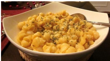
Figure 4: Macaroni and Cheese