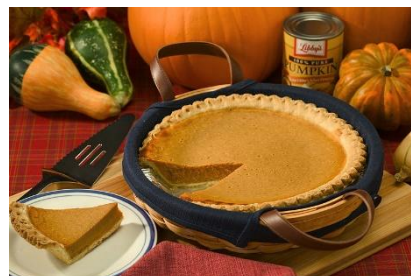
Figure 2: Pumpkin Pie