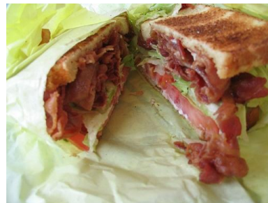
Figure 1: Bacon, Lettuce and Tomato "BLT" Sandwich