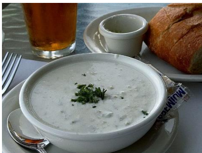
Figure 3: Clam Chowder