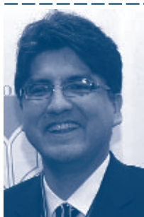
Sherman Alexie (* 1966)