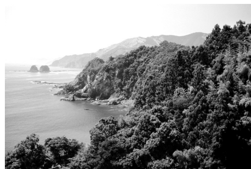
View of a coastline, Kochi, Shikoku