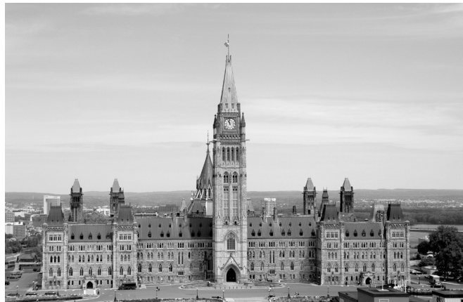
Parliament in Ottawa

The city of Ottawa is the nation's capital.