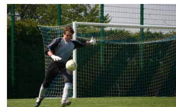
The goal keeper – not the easiest job in a football team!

Now I'd like to tell you what you need to play football. The most important thing is the _____, of course! Moreover it would be good if you had _____ shoes, but you can also play if you don't have them. The _____ needs special equipment, for example goalkeeper _____ for his hands. He also wears a different _____ so he looks different from his other team players.