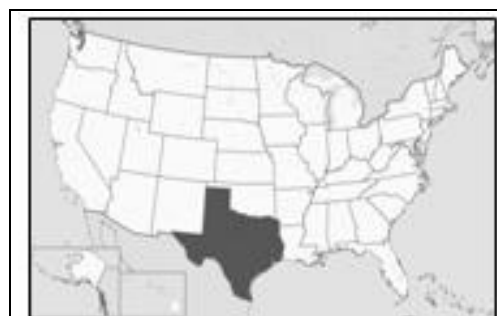
Texas on a political map.

The current constitution took effect in 1876. From 1836 till 1845, Texas was republic as a result of the Texas Revolution or Texas War of Independence. Though being part of the U.S. and therefore a democracy, Texas is the only state to still allow death penalty.