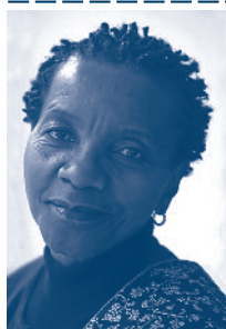
Sindiwe Magona (*1943)