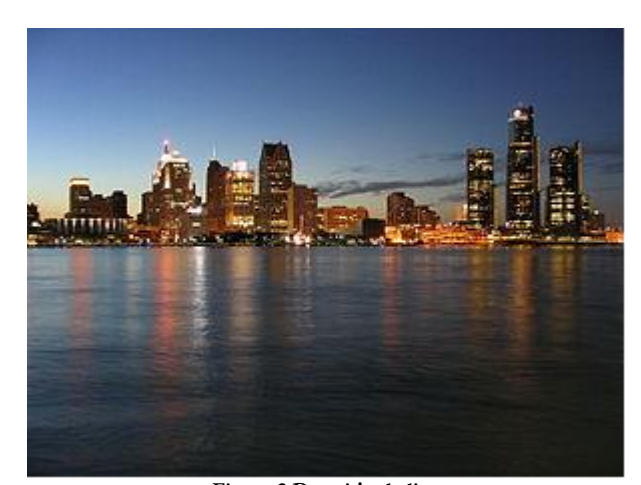
Figure 2 Detroit's skyline

Ben was laid off on day 89. Since then, he is part of the many people struggling in Detroit, the city in the United States with the highest unemployment record and one of the cities with the highest crime rate. Poverty is at close to 40%. Even though Detroit is one of the largest cities in the US, it cannot nearly provide enough jobs for its residents. The city had exploded in the pre-war era, when automobile companies such as Ford set up huge plants. After the war, however, this would change when fewer workers were needed for the manufacturing process.